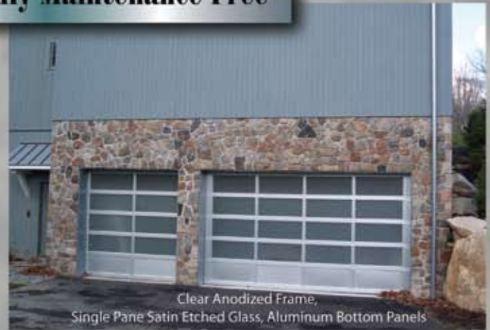
Clear Anodized Frame, Single Pane Satin Etched Glass, Aluminum Bottom Panels

Panel widths and heights can be configured to meet your design requirements. You can choose from glass or aluminum panels, painted or with an anodized finish, regardless of your choices the beauty of the Modern Classic will last a lifetime.