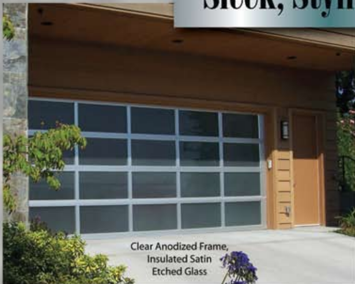
Clear Anodized Frame, Insulated Satin Etched Glass