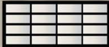
16'-0" x 7'-0" 4-Section, 4-Panel