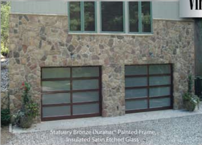
Statuary Bronze Duranar™ Painted Frame, Insulated Satin Etched Glass

Panel widths and heights can be configured to meet your design requirements. You can choose from glass or aluminum panels, painted or with an anodized finish, regardless of your choices the beauty of the Modern Classic will last a lifetime.