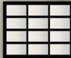
10'-0" x 8'-0" 4-Section, 3-Panel