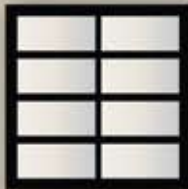
8'-0" x 8'-0" 4-Section, 2-Panel