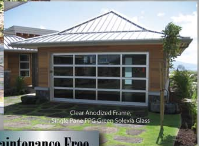
Clear Anodized Frame, Single Pane PPG Green Solexia Glass

Now you can have the stylish appeal of a sleek and architecturally refined garage door, the Modern Classic.