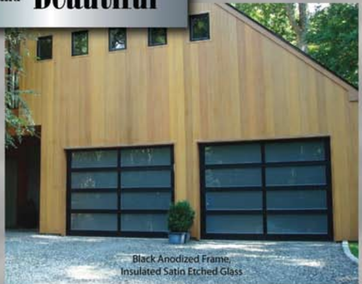
Black Anodized Frame, Insulated Satin Etched Glass