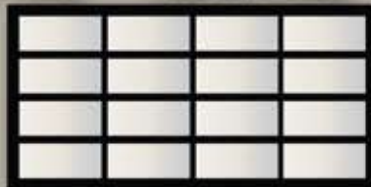
16'-0" x 8'-0" 4-Section, 4-Panel