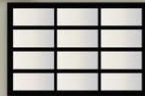
12'-0" x 8'-0" 4-Section, 3-Panel