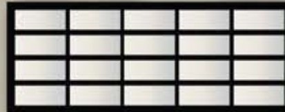
18'-0" x 7'-0" 4-Section, 5-Panel