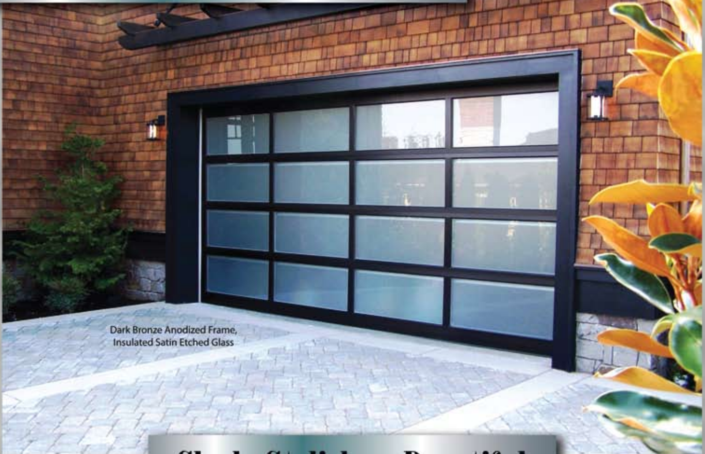
Dark Bronze Anodized Frame, Insulated Satin Etched Glass