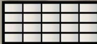
18'-0" x 8'-0" 4-Section, 5-Panel

★ Non-Standard panel arrangements are available to meet your specific requirements.