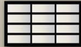
12'-0" x 7'-0" 4-Section, 3-Panel