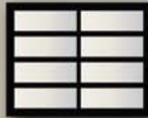
9'-0" x 7'-0" 4-Section, 2-Panel