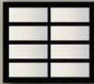
8'-0" x 7'-0" 4-Section, 2-Panel