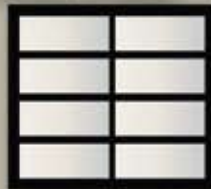
9'-0" x 8'-0" 4-Section, 2-Panel