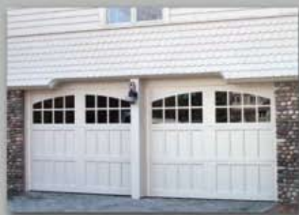
Model T308A, Arched Windows