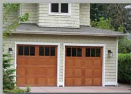
Model T103S, 8' High 4-Section

The Township Collection offers the warmth and beauty of the real wood carriage house doors that conveniently operate overhead; just like conventional garage doors.