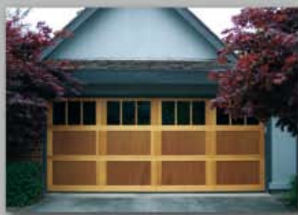
Model T003S, Double Car