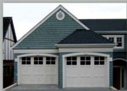
Model TM04S, 3-Panel Design