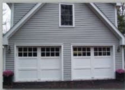
Model T008S, 7' High 3-Section