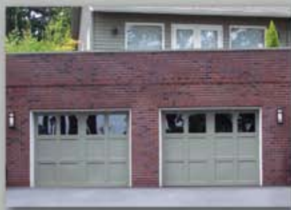
Model T102S, Custom Mullion Width